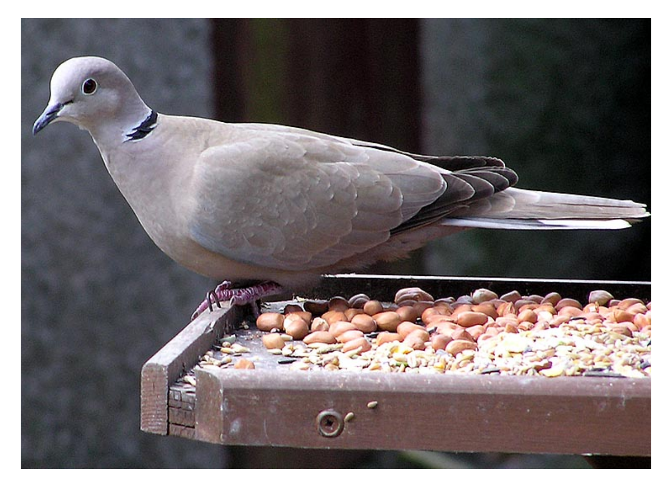
Türkentaube (Collared Turtle Dove)

Slightly larger than the Turtle Dove, the Collared Turtle Dove has a prominent black stripe on the rear and sides of the neck.